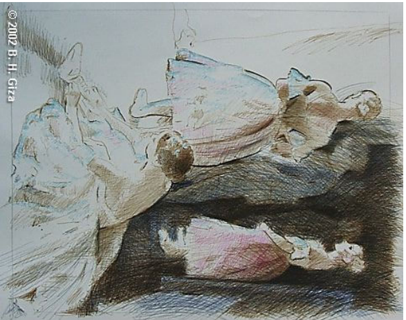
"Backstage at Cinderella" (2002) Pen and Ink on arches paper

WWW.BALLETART.COM ARTWORK BY B. H. GIZA BHGIZA@MAIL.BALLETART.COM