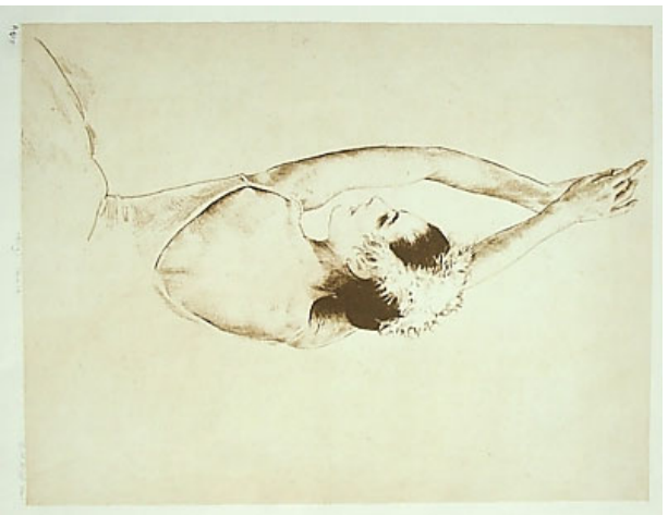
"Holly's Back" (2001)

Artist B. H. Giza creates the plate (drypoint on copper in this case)