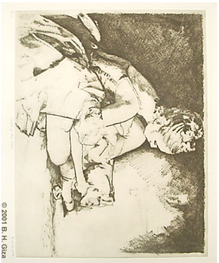
"Padding the shoes" (2001) Zinc plate engraving (drypoint) Edition limited to 50 15 by 18 inches on Hahnmanhle Copperplate warm Edition printed by Hare and Hound Press

WWW.BALLETART.COM ARTWORK BY B. H. GIZA BHGIZA@MAIL.BALLETART.COM