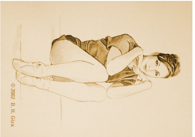
"Tess" (2002) Ink and brush on watercolor paper