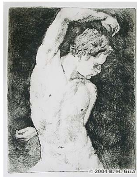
"Dancer's torso 1" (2004)