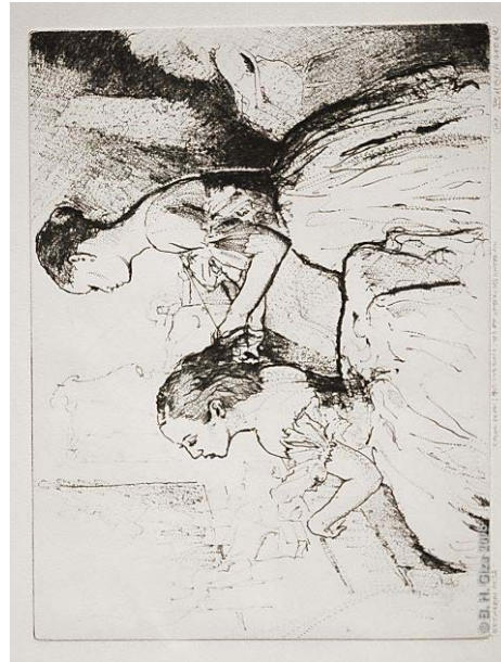
"Between acts" (2006) Drypoint Intaglio on Arches paper