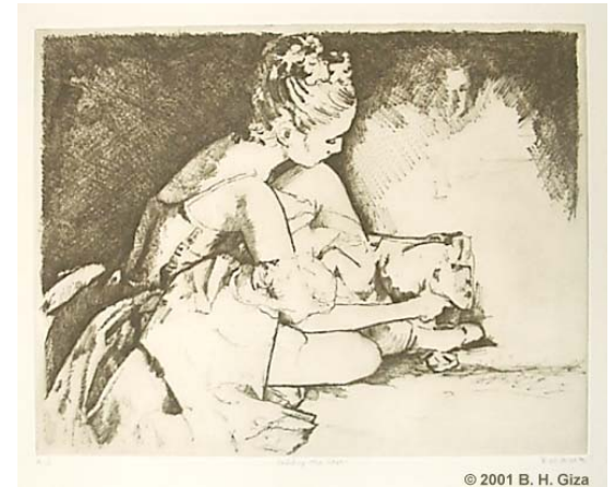
"Padding the shoes" (2001)