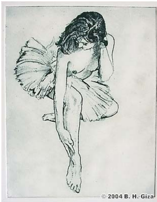
"Dance nude 1" (2004) Drypoint Intaglio on Arches Paper

Artist B. H. Giza creates the plate (in the case of drypoint, by engraving directly into a copper plate). The image is transferred to paper via a special printing press.