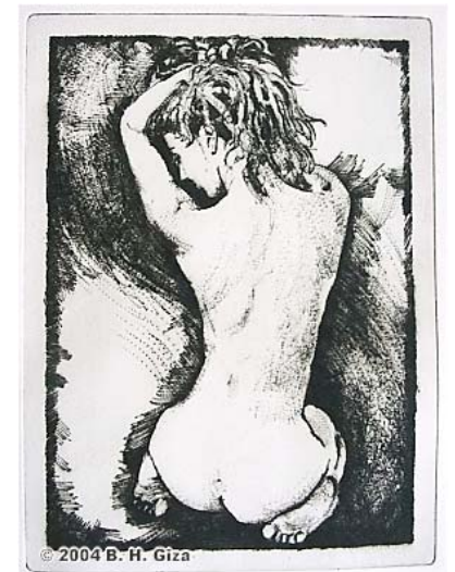
"Austin nude 1" (2004)

15 by 18 inches on Hahnmuhle Copperplate warm Edition printed by Hare and Hound Press