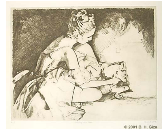
"Padding the shoes" (2001)