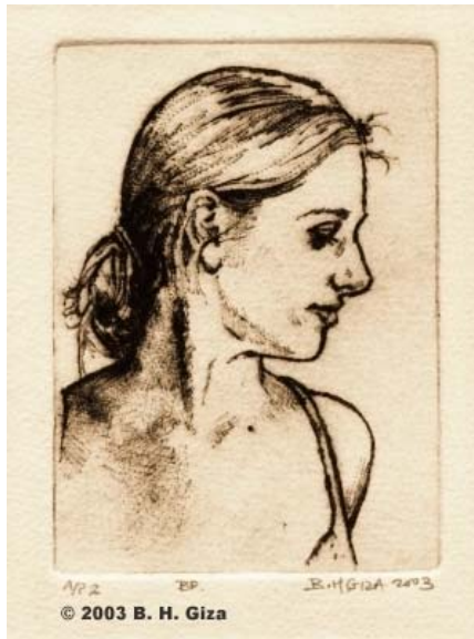
"B. P. 1" (2003)