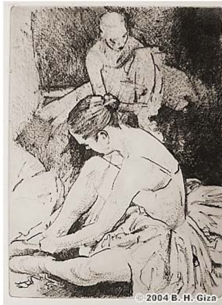
"Dressing room sketch 1" (2004)